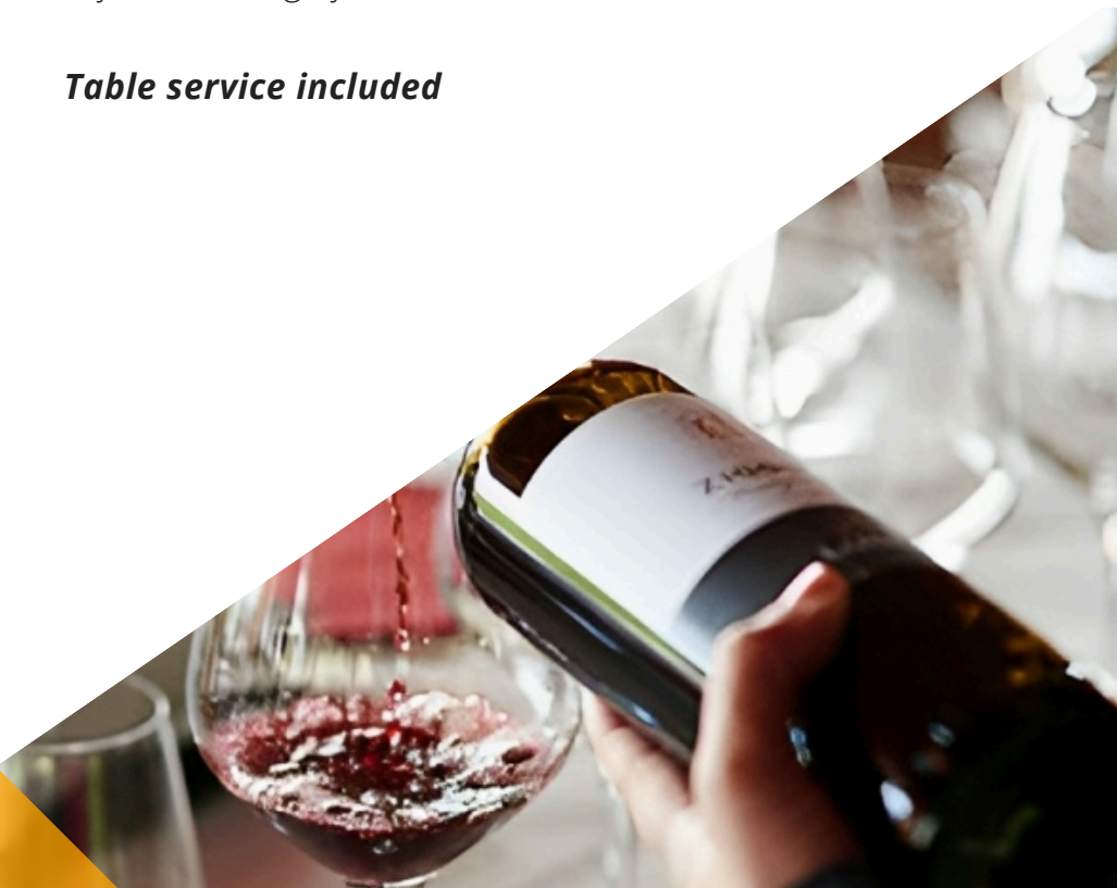
Table service included

Mixers & Juices: Homemade lemonade | Coca-Cola | Tonic water | Ginger ale | Apple juice | Orange juice